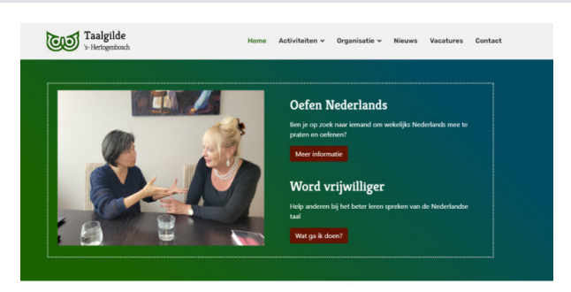
Het Taalgilde Den Bosch brengt taalcoaches en mensen die beter Nederlands willen leren spreken, bij elkaar